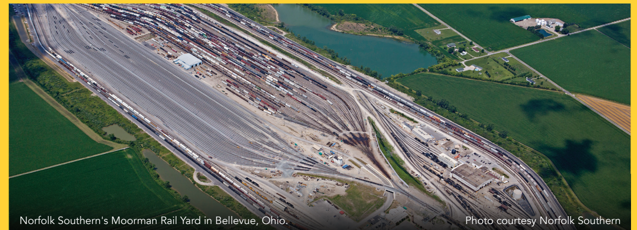
Norfolk Southern's Moorman Rail Yard in Bellevue, Ohio.

How Michael Baker built its reputation in rail yard engineering