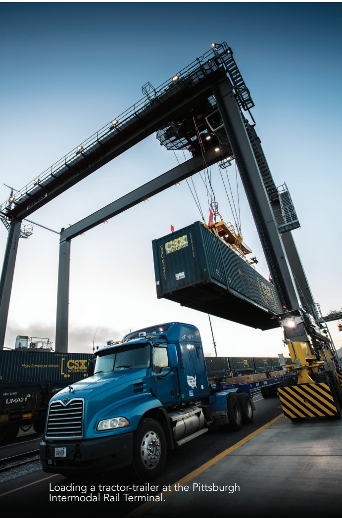
Loading a tractor-trailer at the Pittsburgh Intermodal Rail Terminal.