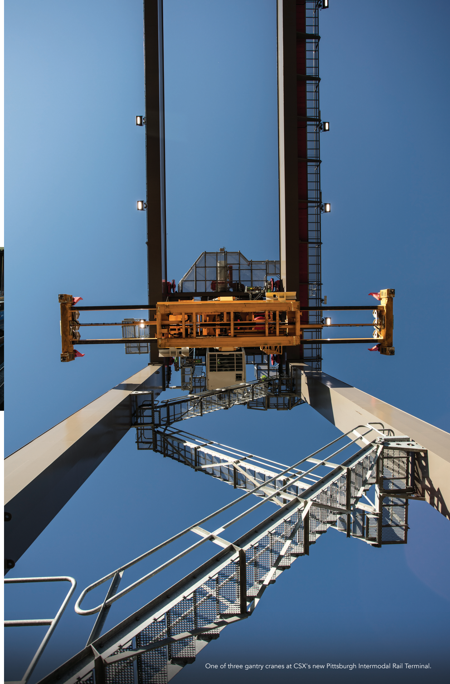
One of three gantry cranes at CSX’s new Pittsburgh Intermodal Rail Terminal.